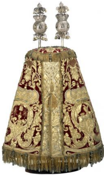
Torah Mantle, Amsterdam c 1675