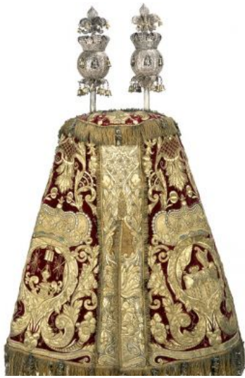
Torah Mantle, Amsterdam c 1675